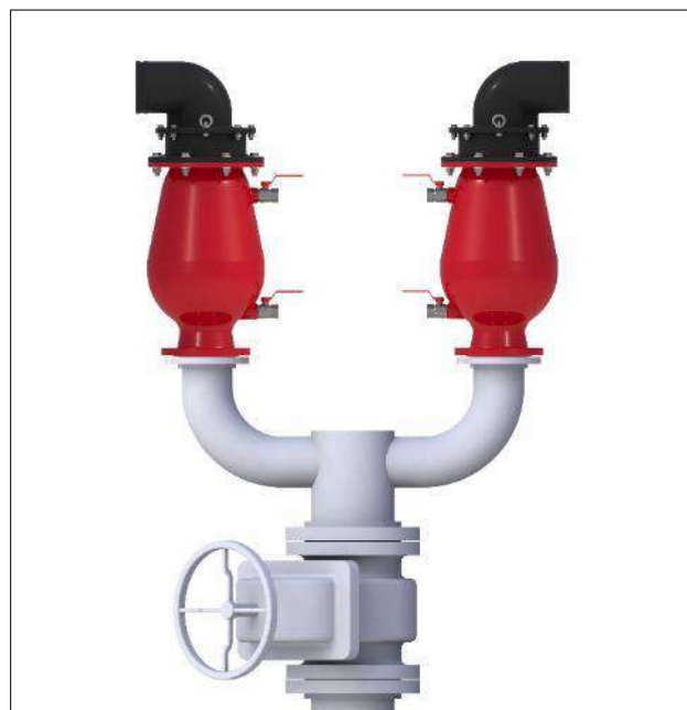
Two Air Valves on a shared Isolating Valve. Air Valves outlets face outward and the Isolating Valve at 45° to Air Valve outlets