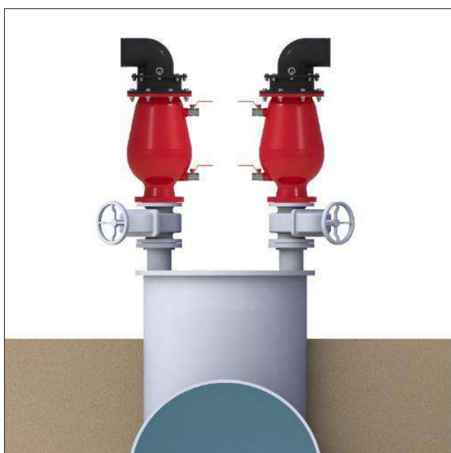
Two Air Valves on an Air Trap with separate Isolating Valves. Air Valve outlets face outward and the Isolating Valves at 45° to Air Valve outlets