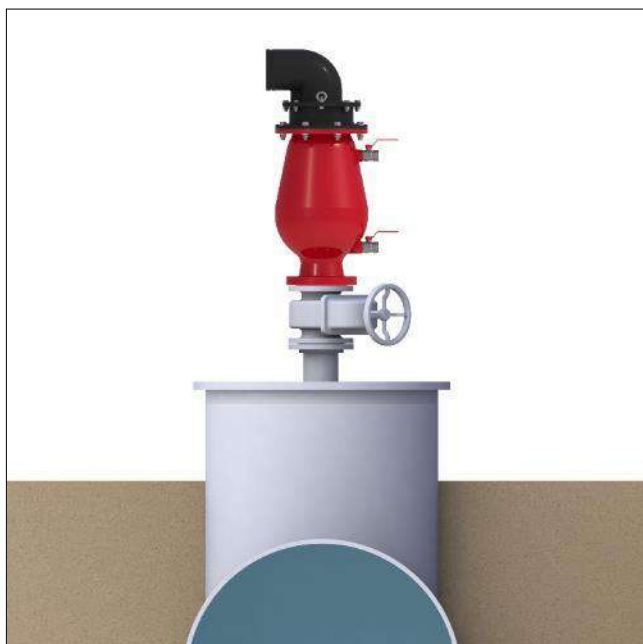
Single Air Valve on an Isolating Valve at 45° to Air Valve outlet