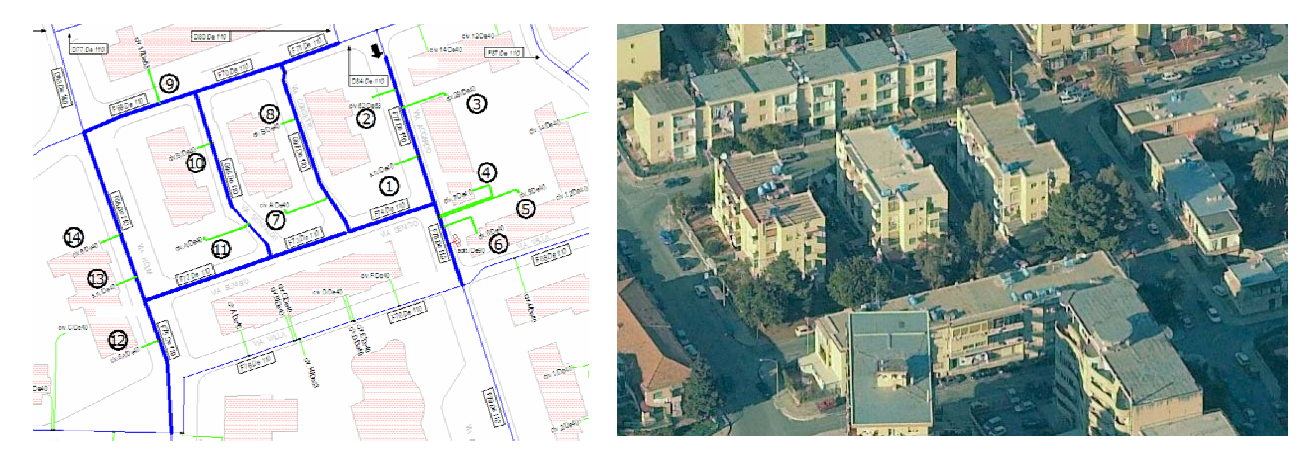
Figure 1.3 Map and view of the small District Metering Area (14 connections, 52 consumers)

Meters installed include 33 Class C turbine meters (age of meters up to 11 years), 17 Class B meters and 2 Class A meters (age of meters higher than 11 years). In addition almost all clients have storage tanks, making consumption at low flows a relevant part of total customer meter consumption.