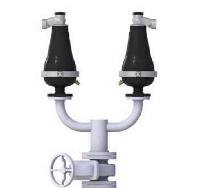
Two Air Valves on a shared Isolating Valve. Air Valves outlets face outward and the Isolating Valve at 45° to Air Valve outlets