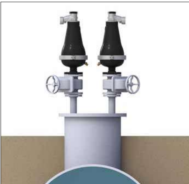
Two Air Valves on an Air Trap with separate Isolating Valves. Air Valve outlets face outward and the Isolating Valves at 45° to Air Valve outlets